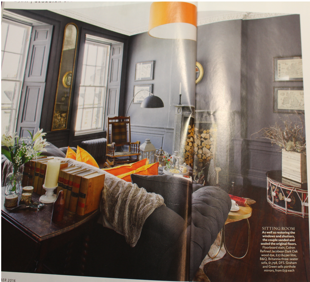
SITTING ROOM As well as restoring the windows and shutters, the couple sanded and sealed the original floors. Floorboard stain, Colron Refined Jacobean Dark Oak wood dye, £27.84 per litre, B&Q. Britannia three-seater sofa, £1,798. DFS. Graham and Green sells porthole mirrors, from £59 each